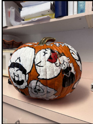
Runner up- Lab "Spooky Mario"