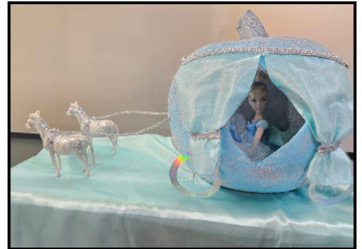
Runner up- Clinic "Cinderella's carriage"