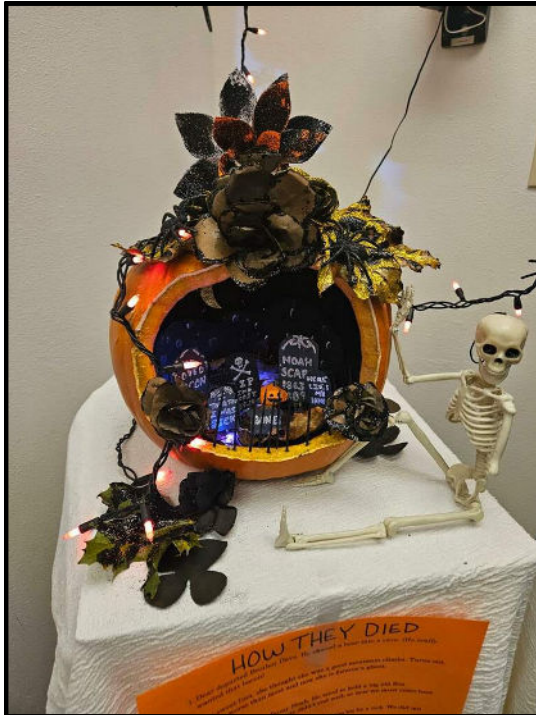
Winner- Diagnostic Imaging "Pumpkin graveyard"

Thank you to everybody who participated in the 2023 pumpkin decorating contest. There is so much fun, and creativity spread among our employees throughout the hospital. It was very fun to see!