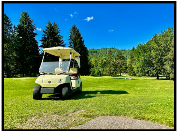
Let's get rolling