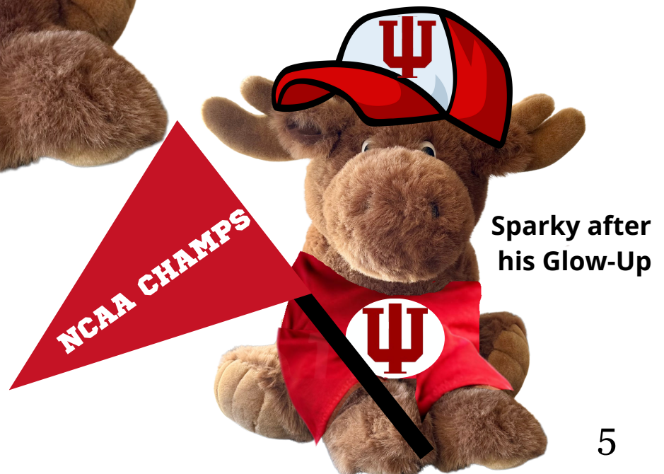
Sparky after his Glow-Up